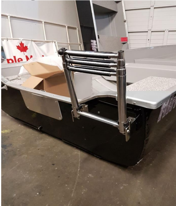
Telescoping Safety Ladder at Transom