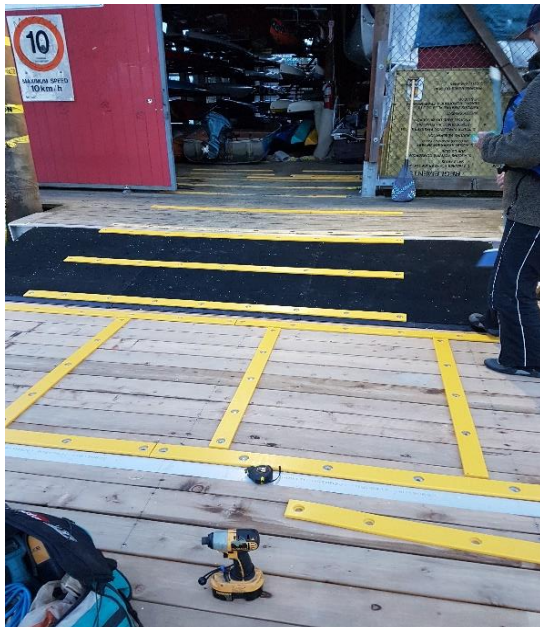
West Barn Door & Ramp