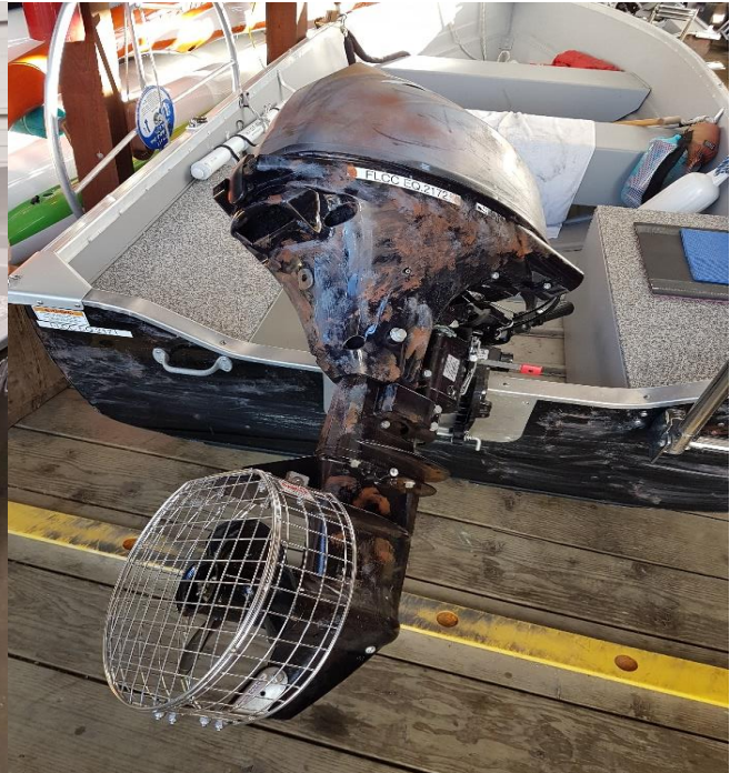
Swimmers Guard for propeller – motors #7 & #8 only.

SAFETY LIGHTS: The coach/safety boats are fitted with a red and green bow light and a 360-degree white light which is stored in a plastic tube in each boat.